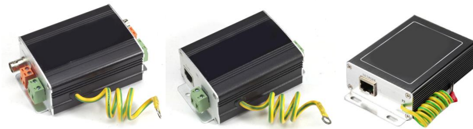
Figure3 3-in-1, 2-in-1 and PoE Lightning Arresters